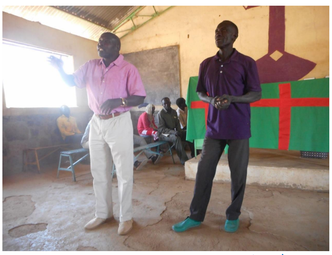
In His Ministry