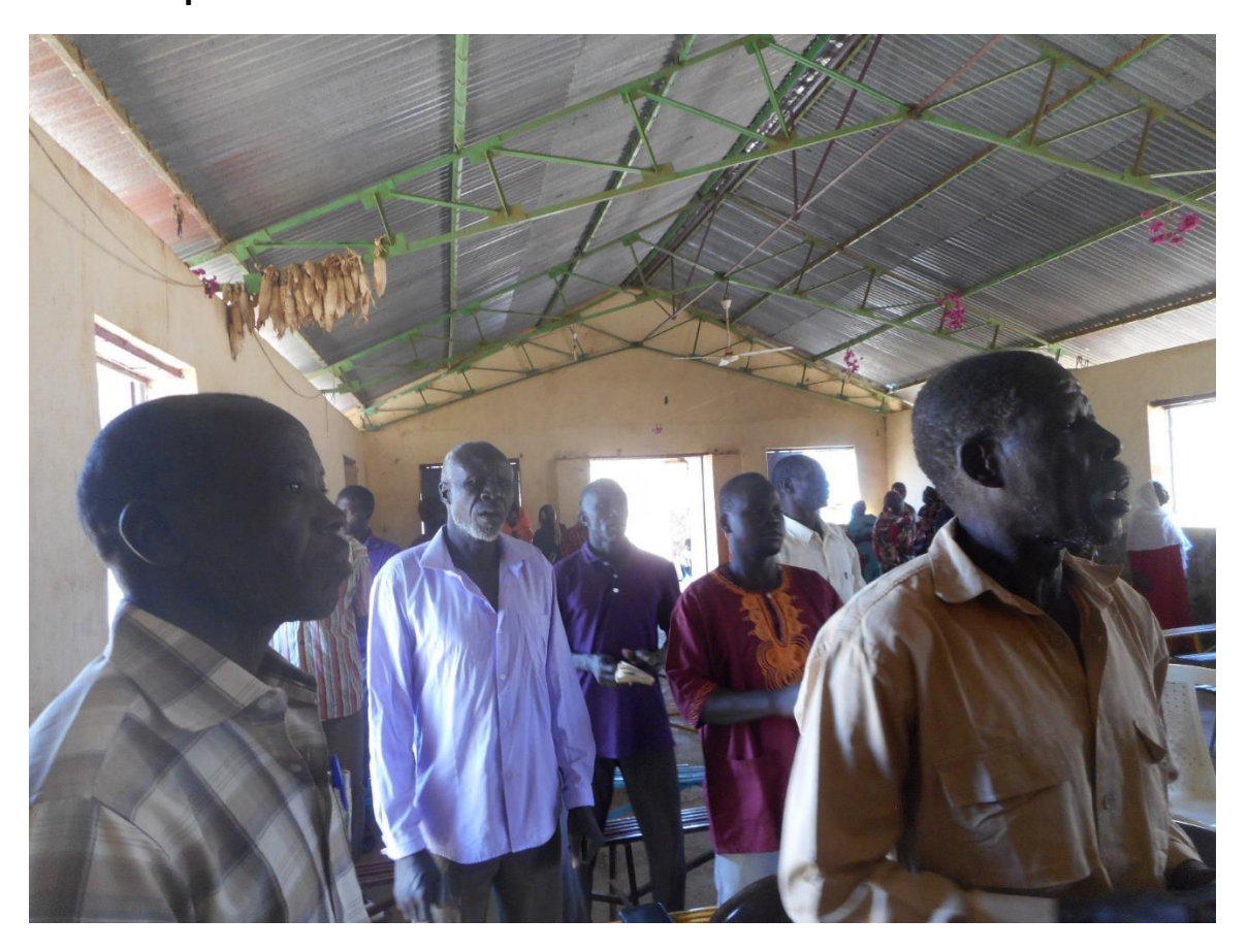
In His Ministry