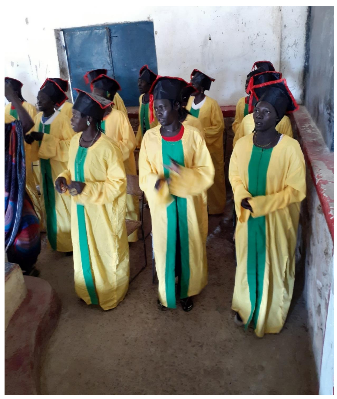
Graduation of students from sewing class program in Irsalia-Nuba Mountains