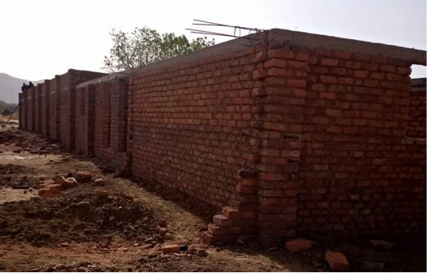
You can see the end of the building and this side of line is pointing to South of school direction and will take 9 classrooms together. And the other side you can they put conjunction bricks to join other left side of school building