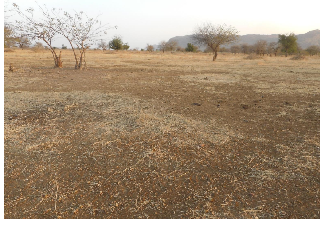
This field is for sorghum crops and these seeds are very productive and grow in the Nuba Mountains' soil. Not only that but the local people like it most and it is very popular for food in the region and whole Sudan.